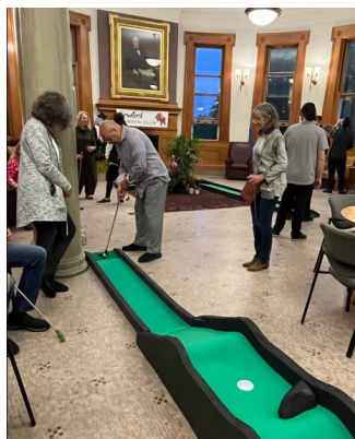
More pictures from the daytime Mini Golf @ Blackstone and Saturday evening's Mini Golf: AFTER HOURS. Thanks to Harvey Goldstein for taking photos of the events!