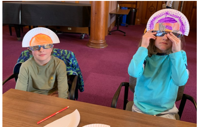
Kids getting ready for the solar eclipse.