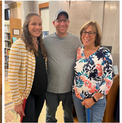
People of all ages had fun at Mini Golf @ Blackstone and Mini Golf: AFTER HOURS.

Task Force looking at best practices in hiring and supporting a diverse staff. We had an initial kickoff meeting and began drafting a survey to send to other LION library directors to better understand current practices. We will work toward creating best practices guidelines for LION libraries.