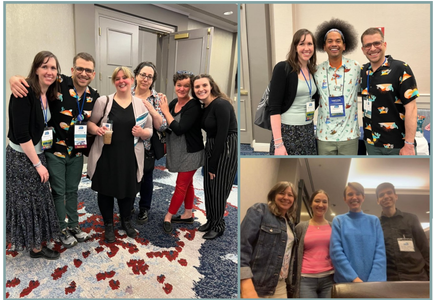
Blackstone staff at the Connecticut Library Association Conference.