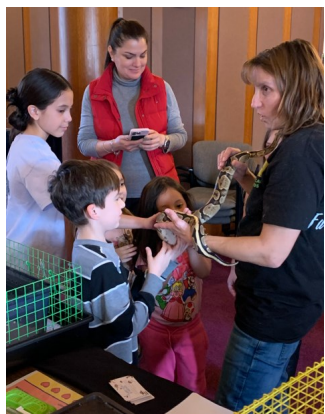
People of all ages loved engaging with and learning about the animals at Furry Scaly Friends.