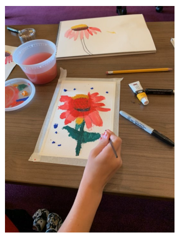
Children's detailed watercolor paintings of coneflowers.