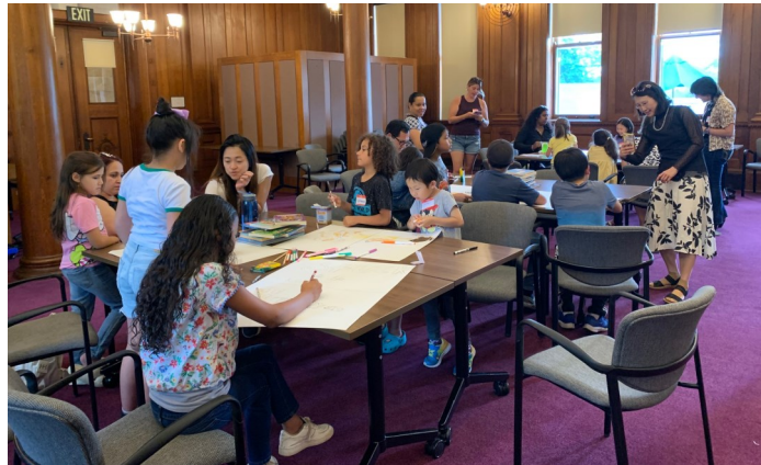
The Homeschool Meetup group learned about the Art of Storytelling.

Our Homeschool Meetup group in June was visited by children's book publisher Star-