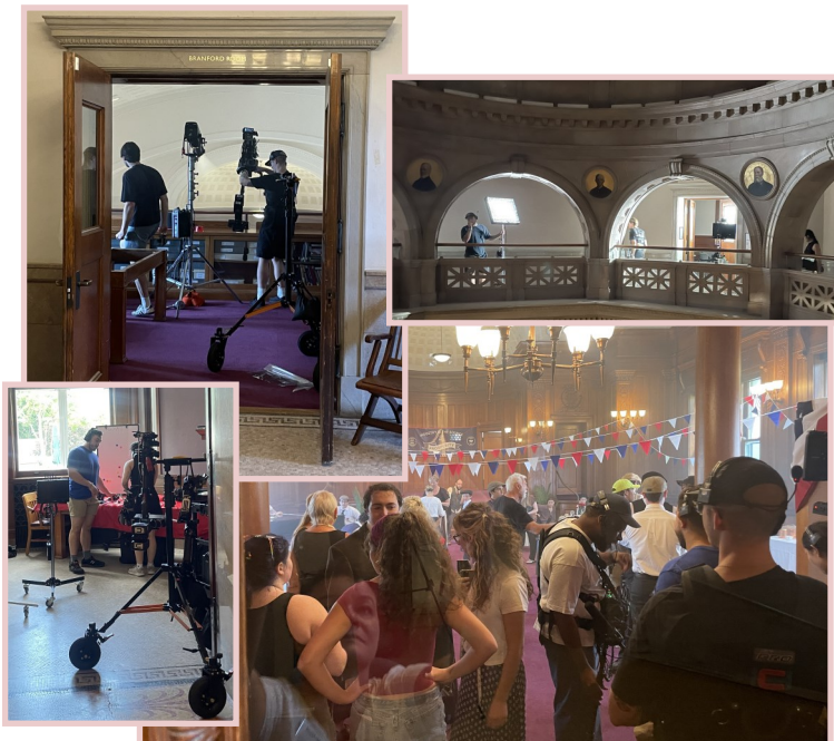
Quiet on set! Filming during "Salvation is Within You!" at the Blackstone Library.