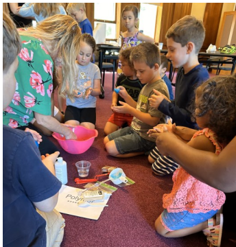
Science Saturday participants learn about water absorbing polymers during the Gross But So Cool program.