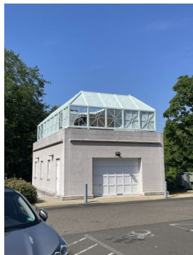
The chiller screen frame was replaced in pieces and then the screens were added after. The finished screen looks great!