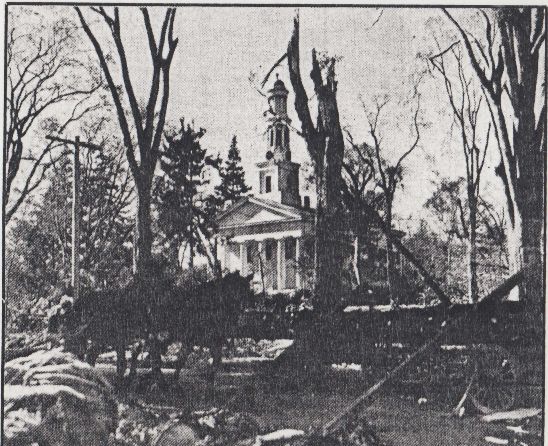
Horses help to clear the debris on Madison Green