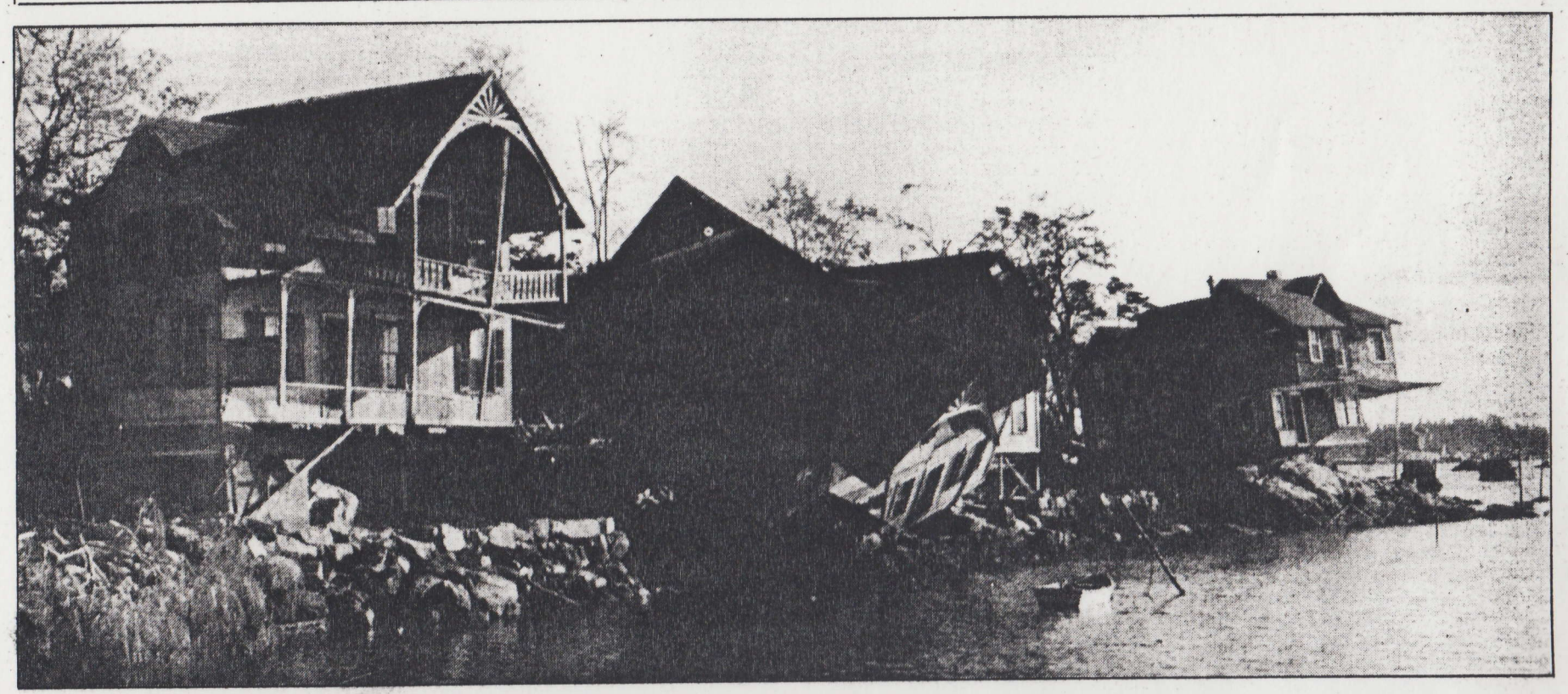
STONY CREEK waterfront homes fared badly when the hurricane and tidal wave struck.