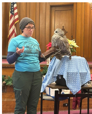
Timmy, a barred owl, paid a visit to the homeschool group.

We had a special Homeschool Meetup this month with the Denison Pequotsepos Nature Center. The theme of the program was Owl Prowl, and participants got to meet Timmy, a barred owl, up close and learn about the amazing adaptations that make owls so special, including the unique features of their eyes, ears, talons, feathers, and necks! They also learned about the different types of owls that live in Connecticut and the sounds they make. Afterwards, families got to dissect an owl pellet