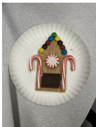
Kids created edible graham cracker homes to celebrate the season.

December flew by in Youth Services! This month I was excited to visit Walsh Intermediate School to do presentations for the 5th graders about the resources available at the library and some of our upcoming programs. We passed out library card applications to students and shared information about some of the volunteer opportunities available for middle school students at the library. We love our partnerships with Branford schools and are always excited for the opportunity to visit and share about the library!