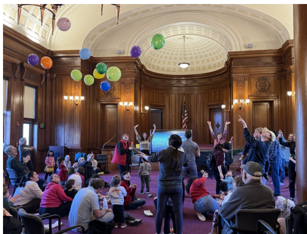
Happy Noon Year's Eve!

and sort and identify the bones they found. Participants discovered rodent, shrew, mole, and bird bones in the pellets, which helped them learn more about what these birds of prey eat.