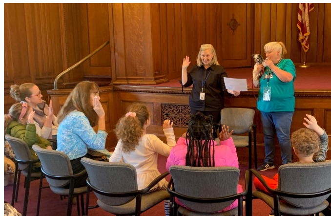
Attendees taking the Gizmo pledge to support better mental health.

For our Homeschool Meetup in April we celebrated National Poetry month by reading and writing some poetry of our own! We started by writing an acrostic poem using the letters of our first names, and came up with some beautiful poems about our favorite qualities. We then examined paintings,