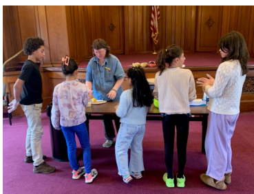
Teens learn about cooking in the Food Explorers program.

We had a special visit from some very cute therapy dogs in April, when the East Shore District Health Department came to do a read-aloud of Gizmo's Pawsome Guide to Mental Health . The dog Gizmo, the star of the book, made an appearance, along with his friends and fellow therapy dogs, Ruby and Tiny Teddy. Participants had a wonderful time meeting the dogs and learning about strategies to promote good mental health.