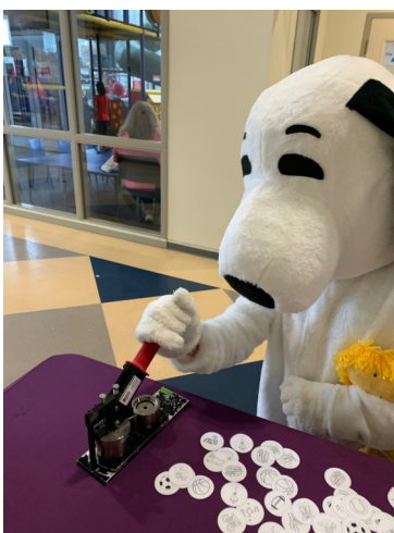
Snoopy visited our booth at Healthy Kids Day and made a button with our button maker!