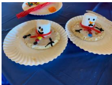
Melting snowmen cookies.