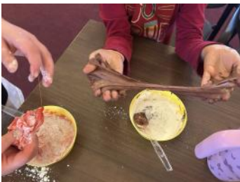
Edible slime being made.